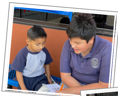
Grade 7 and Kindergarten team up to read stories to each other